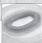
Adapt Convex Barrier Rings