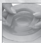
Adapt Barrier Strips