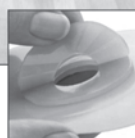
Adapt Barrier Rings