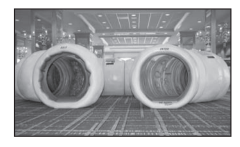
40-foot Colossal Colon<sup>©</sup>

A colon celebrity appeared recently at the UOAA Convention in Florida. The 40-foot Colossal Colon® travels around the country in a custom 18-wheeler and provides more than a hands-on learning