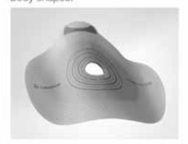
Full-circle filter to reduce ballooning for comfort,

Elastic barrier to fit real body shapes.