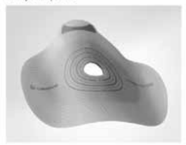
Full-circle filter to reduce ballooning for comfort,

Elastic barrier to fit real body shapes.